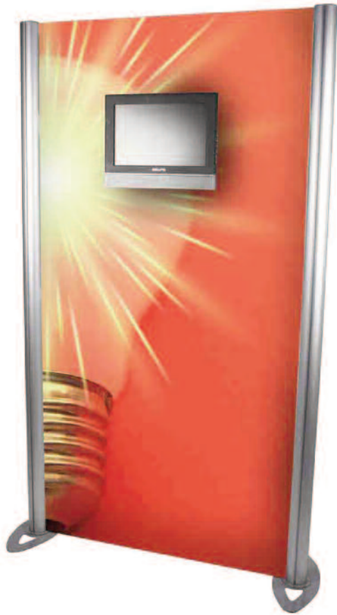
LCD monitor not supplied

This unique media stand allows you to merge your graphics with an audio visual message. The screen can be moved vertically and horizontally. An attention grabber for any exhibitions