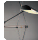
LED Flood light PS1050 Requires US-LINEAR